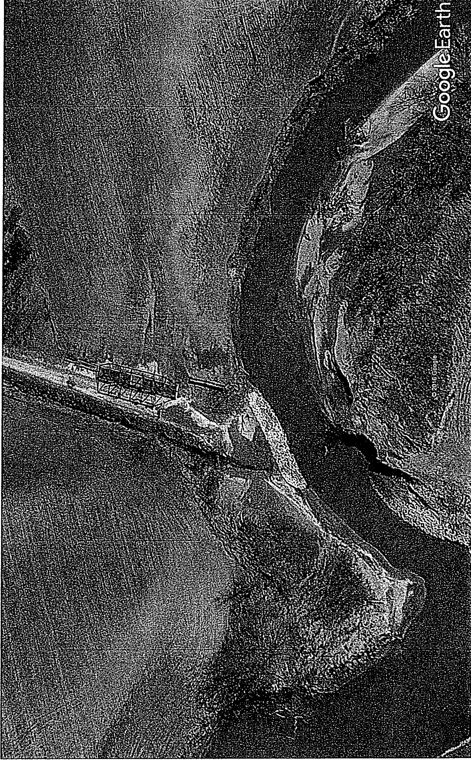
Image of a comparable project in Madison County, IA 3-10-2016 Bridge in right-of-way of road