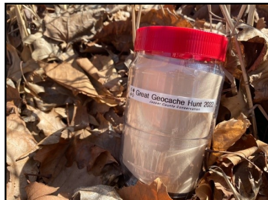
Right: Ten geocaches, similar to this one, will be hidden in Jasper County parks this year.

If you do not already have GPS on your mobile device, we recommend downloading the free Geocaching app. Geocaches will remain in the parks for the year so you'll have plenty of time to locate them all.