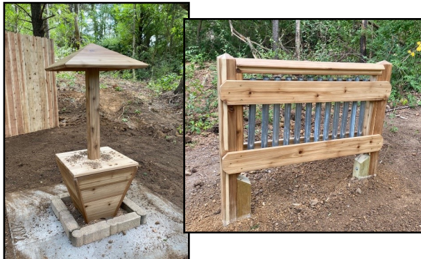
Above: New additions to the Mariposa Playscape focus on music and movement.

We've also installed two magnifying stations to further enhance nature exploration and a fence panel which will eventually hold more elements to experiment making music. The Little Free Library has been getting lots of use, along with the big sandbox! Make plans to bring a child to Mariposa Park this fall and have fun exploring!