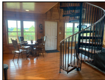
Above: The cabin at Uhlenhopp Arboretum is available to rent. It is beautiful at all times of the year!