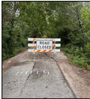
Right: Trail closure on Chichaqua Valley Trail for repairs.

The Chichaqua Valley Trail is undergoing some much needed repair work from approximately Indian Creek to W. 108 th St N. This project includes 4603 SY full depth reclamation, excavation, subgrade prep, and then 4516 SY of 6" continuous reinforced PCC (concrete). This project started August 1st and will be done in mid-September 2023 and is fully funded by Jasper County ARPA dollars totaling $425,000.