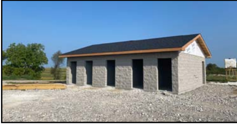
Above: The shower house walls are up at Mariposa Park's Bison Ridge Campground.

overflow parking. In addition, a cottage is being built this fall and winter with a second to hopefully follow in 2024-2025. The new campground and the first cottage are all slated to open in 2024! Funding sources for the project include a Land and Water Conservation (LAWCON) grant of $129,000, matching dollars from Jasper County Conservation, and $400,000 in Jasper County ARPA money.