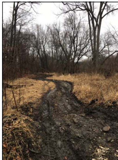
Above: The damage and erosion caused by illegally driving through the Beyer's Bridge River Access along the South Skunk River.

The amount of garbage that we remove, including ammo casings, furniture, beer cans, and anything that can be burned, is unbelievable and completely disrespectful to all who want to use the area properly. It needs to stop. Please help us to stop this and other illegal activity at our conservation areas so we can get back to our rewarding, nurturing, and good for the soul work!