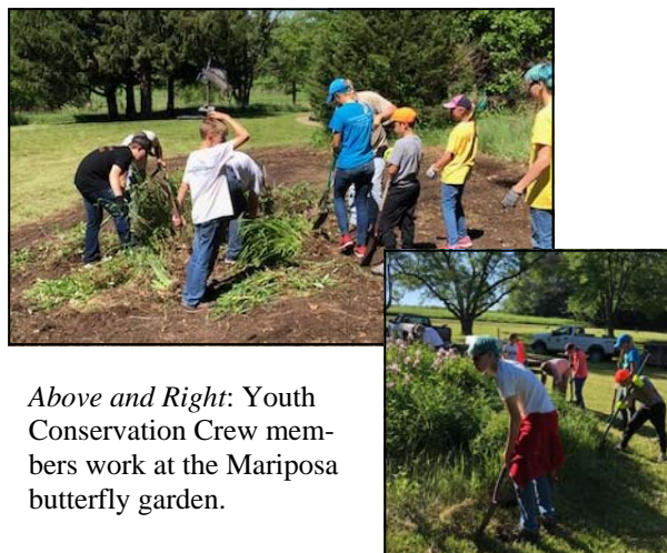
Above and Right: Youth Conservation Crew members work at the Mariposa butterfly garden.

Other projects on the list for this summer include invasive brush removal and trail work. Mariposa Park is still closed to the public while the lake restoration continues, however, the work can be viewed from the highway. The park is anticipated to be open later this fall.