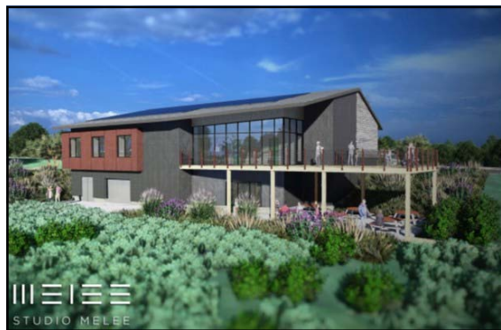
Above: Architect’s image of the Environmental Education Center.

Thanks for helping us reach our fundraising goal!