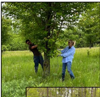
Left and Below: Staff from Chevron Renewable Energy volunteering in county parks.

Employees from Chevron Renewable Energy Group volunteered for two full days with Jasper County Conservation this spring! The dedicated staff spent a day at Mariposa on the Nature Playscape Trail and then another day at Uhlenhopp Arboretum removing tree cages. Thank you so much to Chevron for your dedication to our community and the environment!