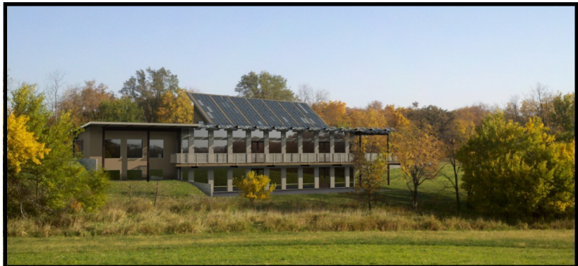
Above and Below: Illustrations of what the new Environmental Education Center will look like, facing from the north and south. It will be located just south of Newton.