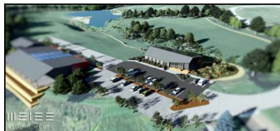
Above: Architect's design for the Environmental Education Center, a project that recently received $400,000 in ARPA funding.