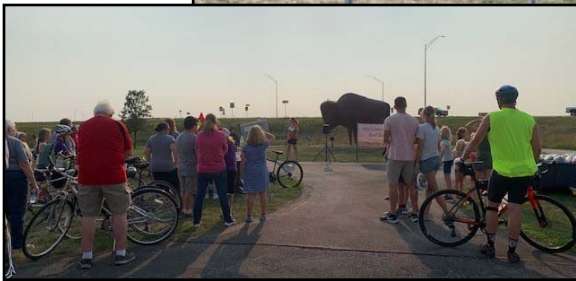
Above: A large sign welcomes visitors in Monroe to the new bike trail. Trail enthusiasts gather in Prairie City on September 8 for the Red Rock Prairie Trail dedication.