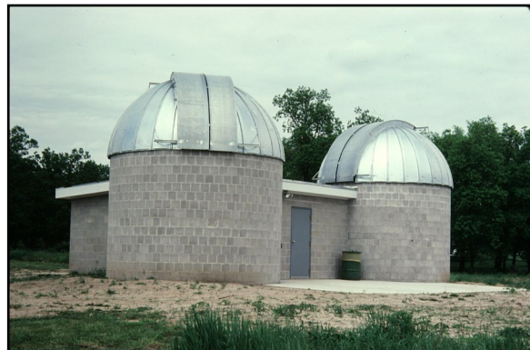
Below: The Ashton Observatory nears completion in 1983.